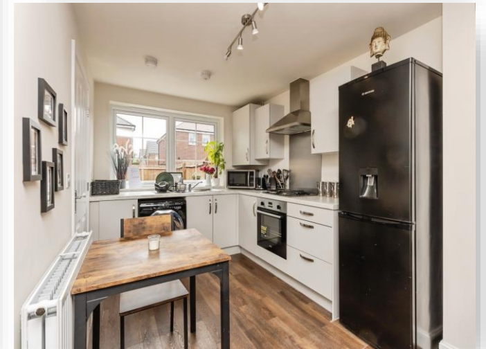
Horsepoole Street, Bingham Nottingham NG13 7BP