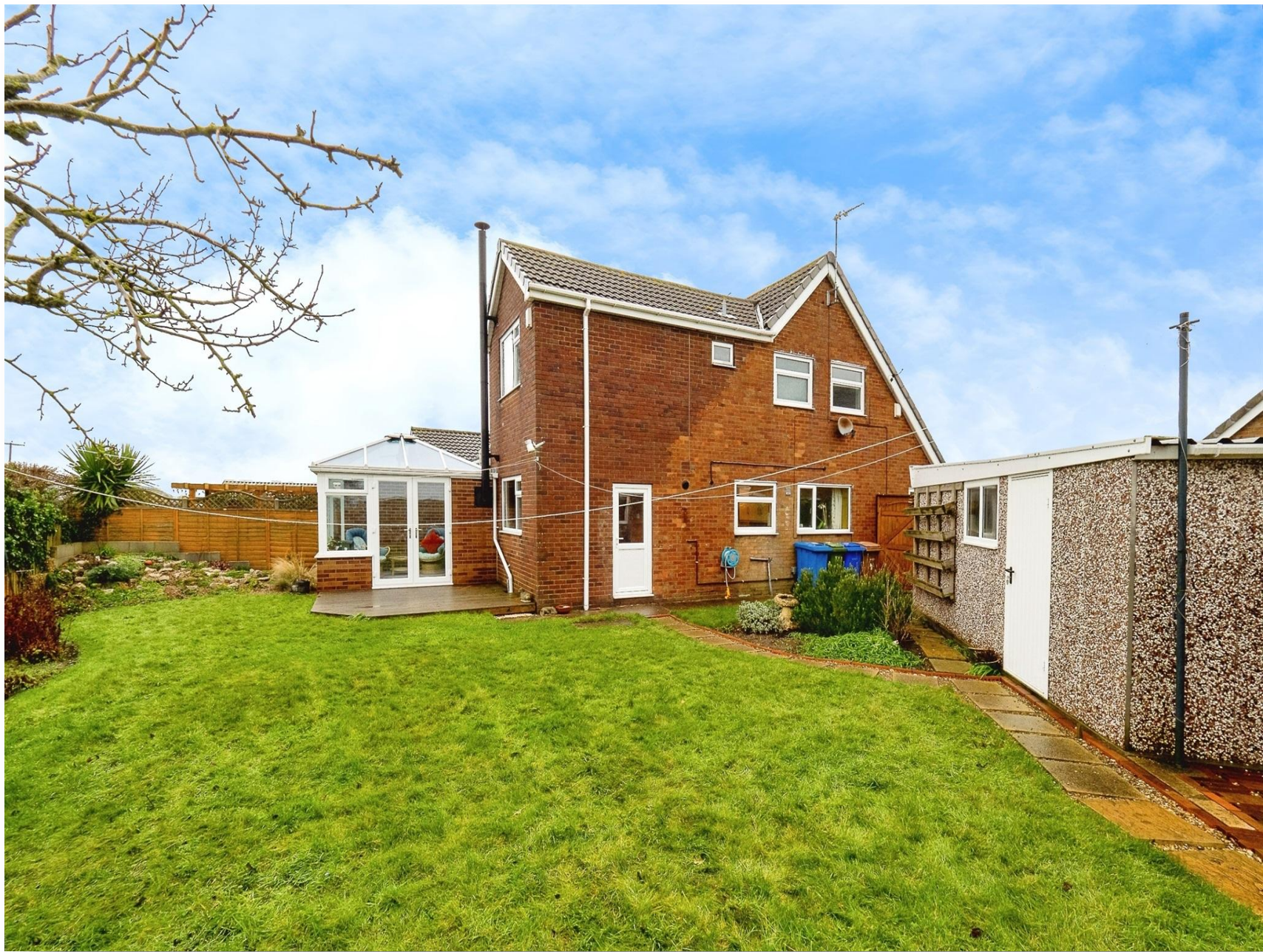
Cawood Crescent, Skirlaugh, Hull, HU11 5EW