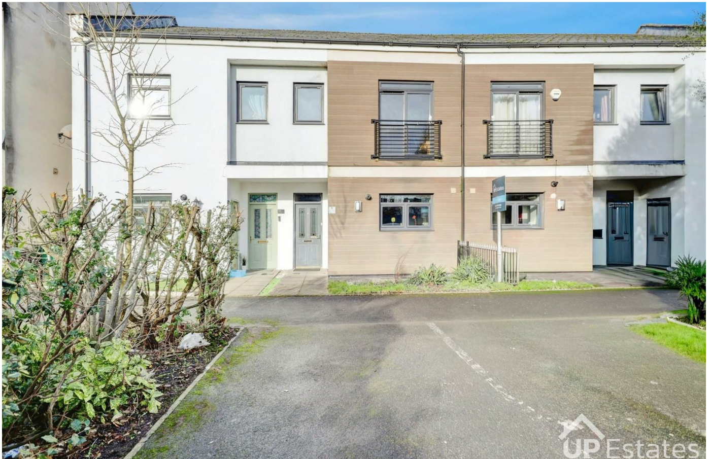
Paladine Way, Coventry