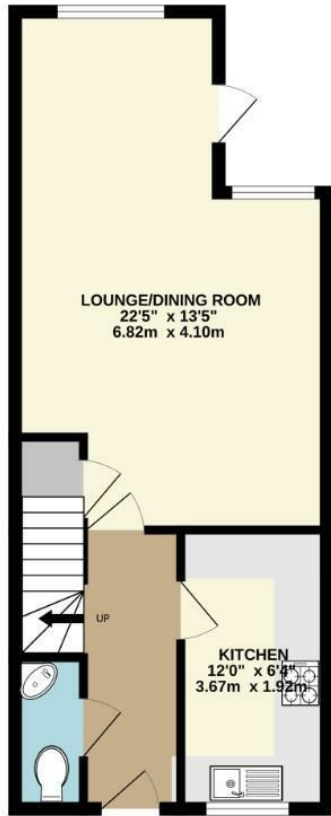
GROUND FLOOR 427 sq.ft. (39.6 sq.m.) approx.