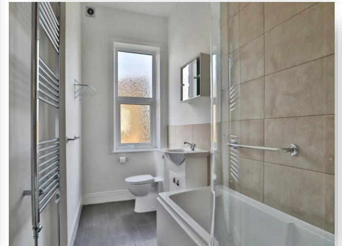
Broadgate Lane, Horsforth Leeds LS18 4AG