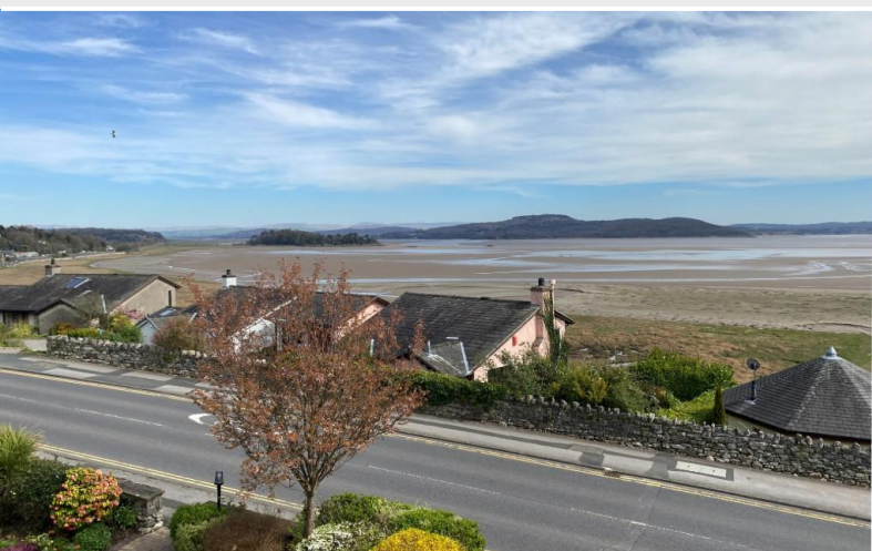
View to Morecambe Bay

A well presented Apartment in a pleasing modern style - it feels spacious, light and contemporary with the most magnificent and enviable views to Morecambe Bay and the hills beyond.