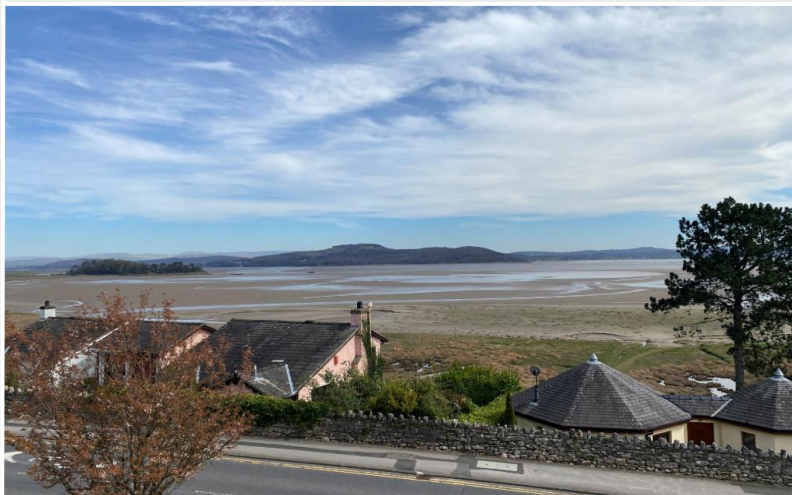
View to Morecambe Bay