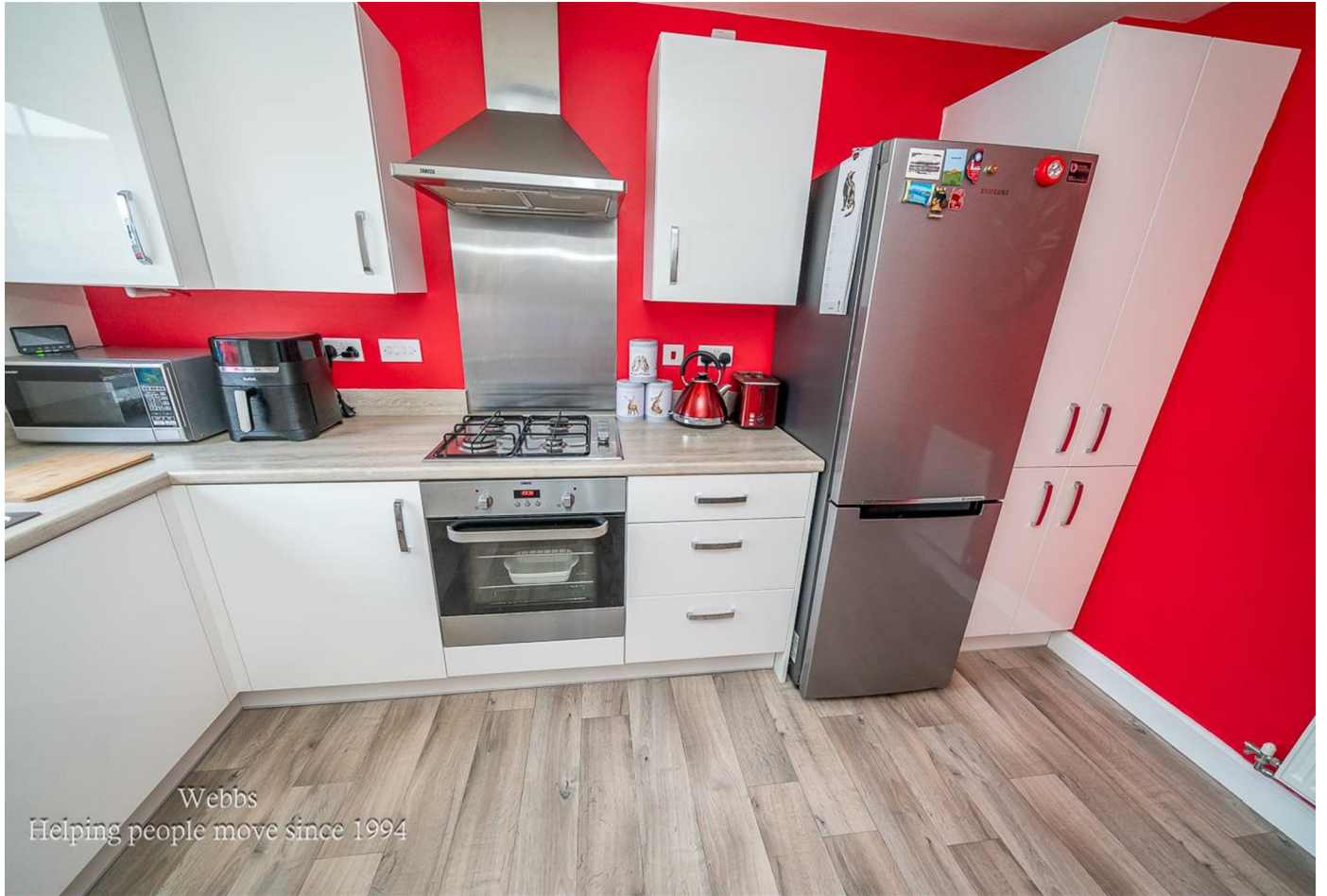
Webbs Helping people move since 1994