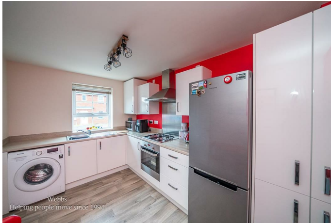
Webbs Helping people move since 1994