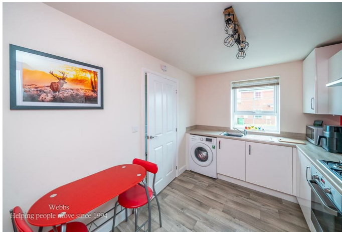
Webbs Helping people move since 1994