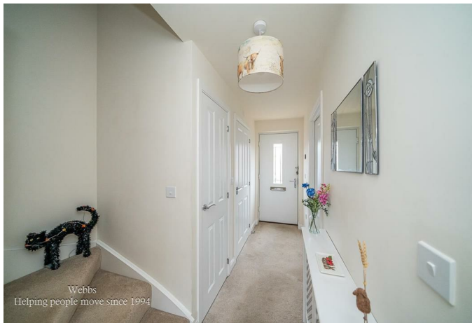
Webbs Helping people move since 1994