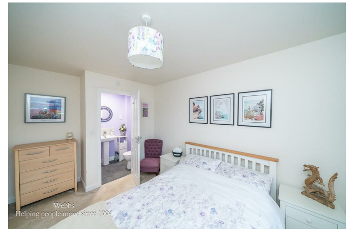
Webbs Helping people move since 1994