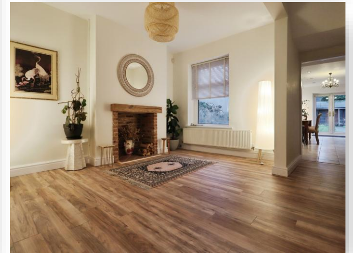
Redlands Road, Penarth, CF64 2WH