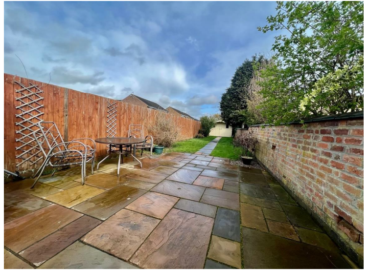
The rear of the property is mostly paved to lawn with a decking area to the top. There are two outbuildings and a further shed. A gate to the side gives access to the front where there is a graveled area offering off road parking. Please note that there is an access gate to next door to allow bins to be taken across the property's garden to the front.