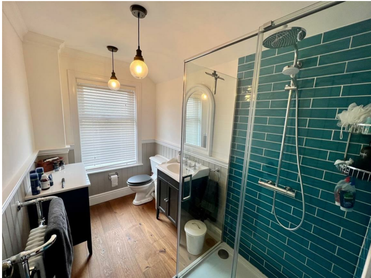
With a window to the rear, fitted with a low level WC, pedestal wash hand basin and walk in shower cubicle.