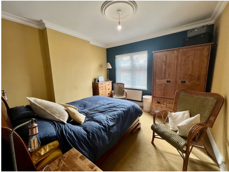
With a window to the front, radiator.