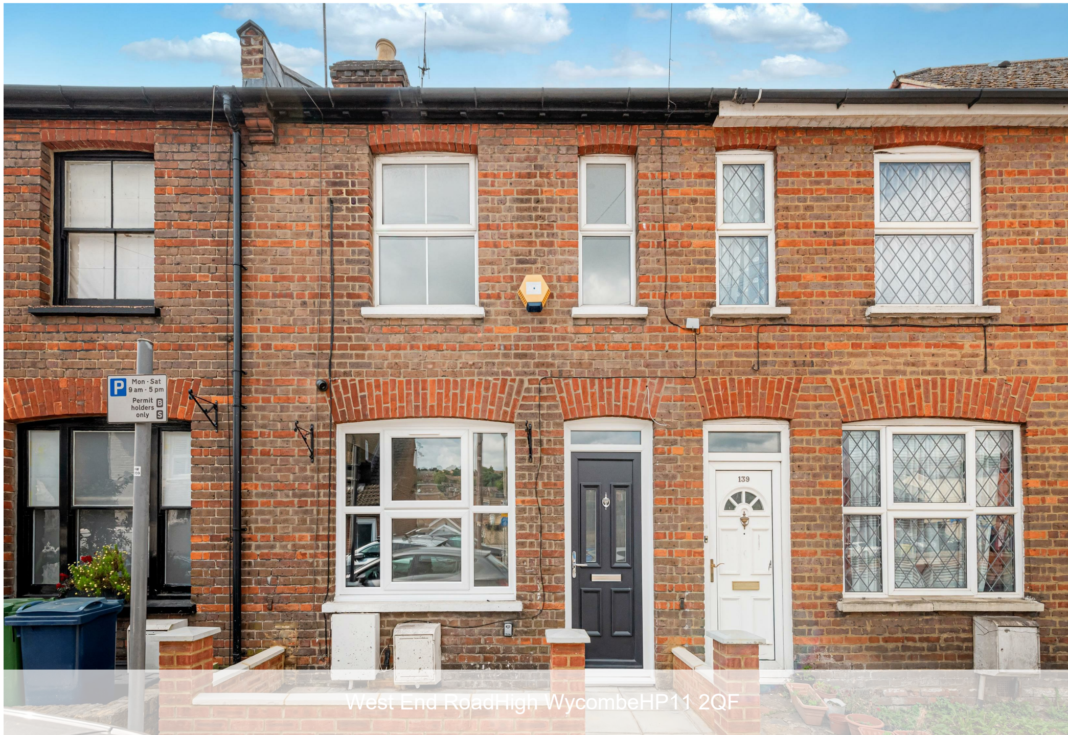
West End Road High Wycombe HP11 2QF