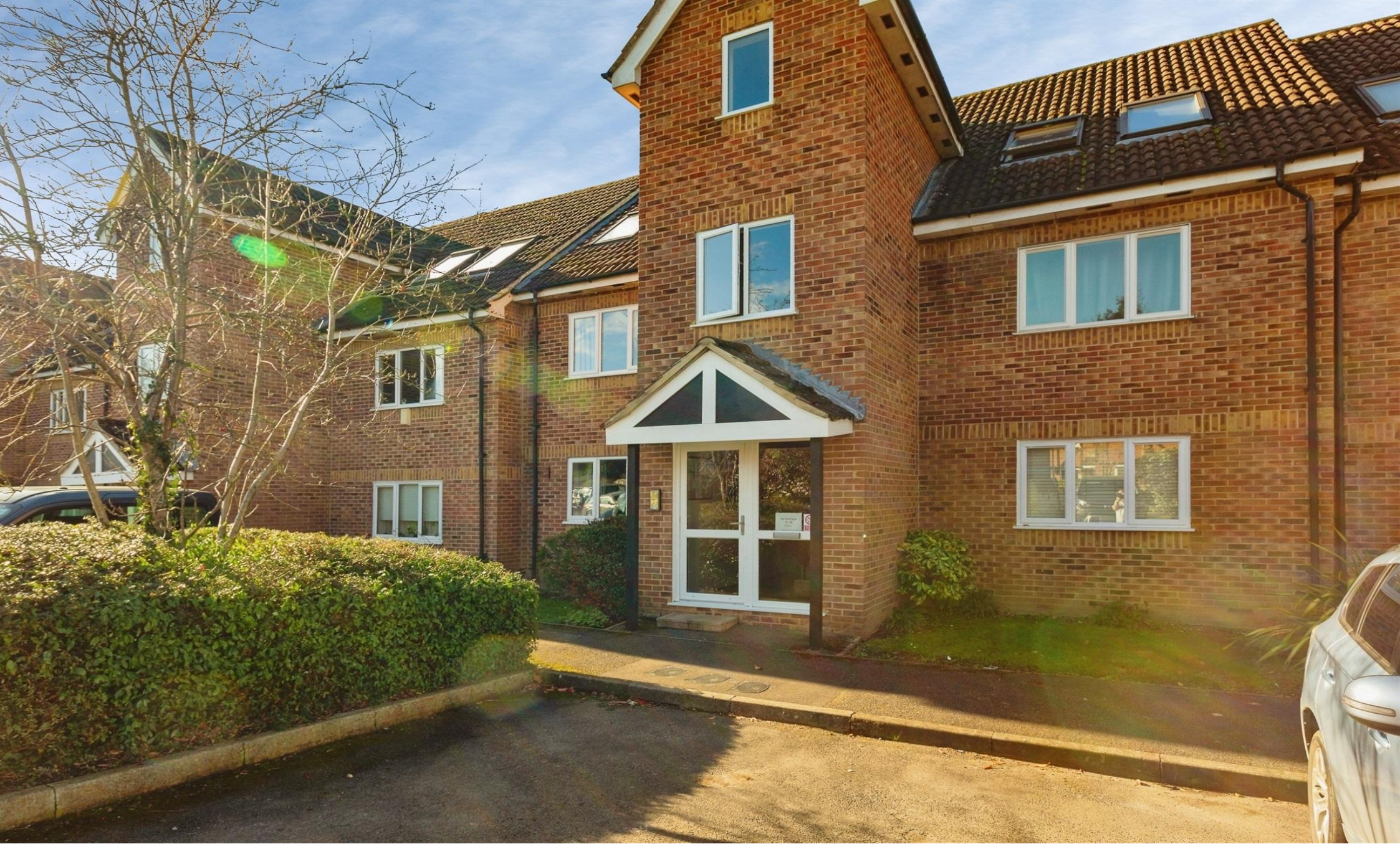
Old Fives Court, Burnham Slough SL1 7ET