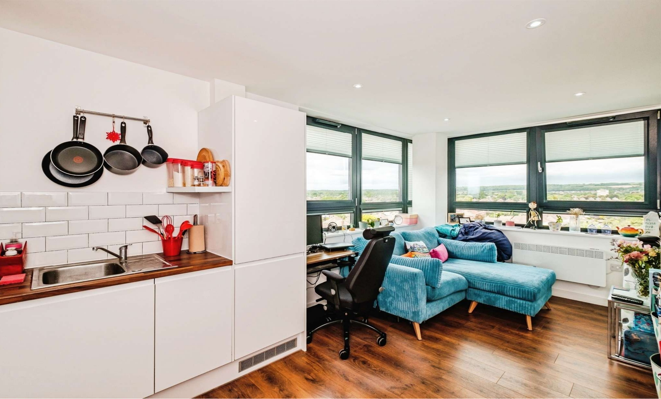
Westmoreland House Strand Parade, Goring-By-Sea Worthing BN12 6FQ