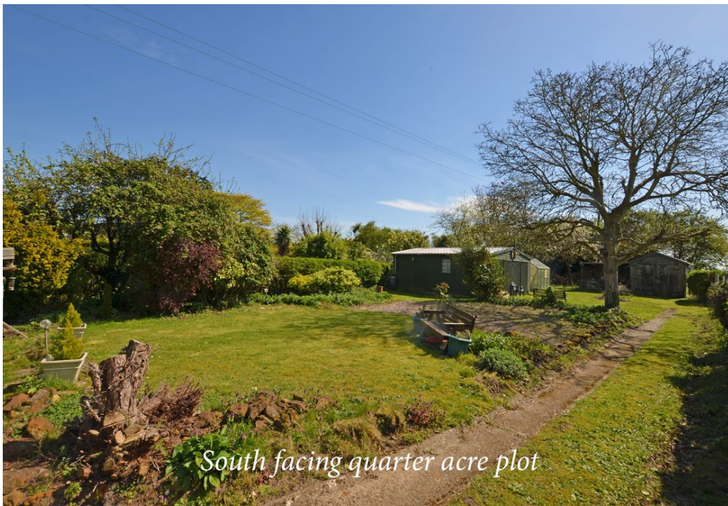
South facing quarter acre plot