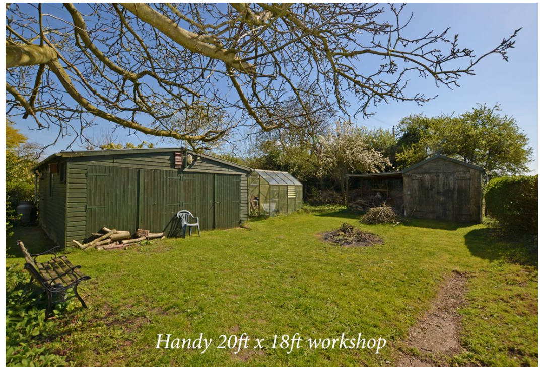
Handy 20ft x 18ft workshop