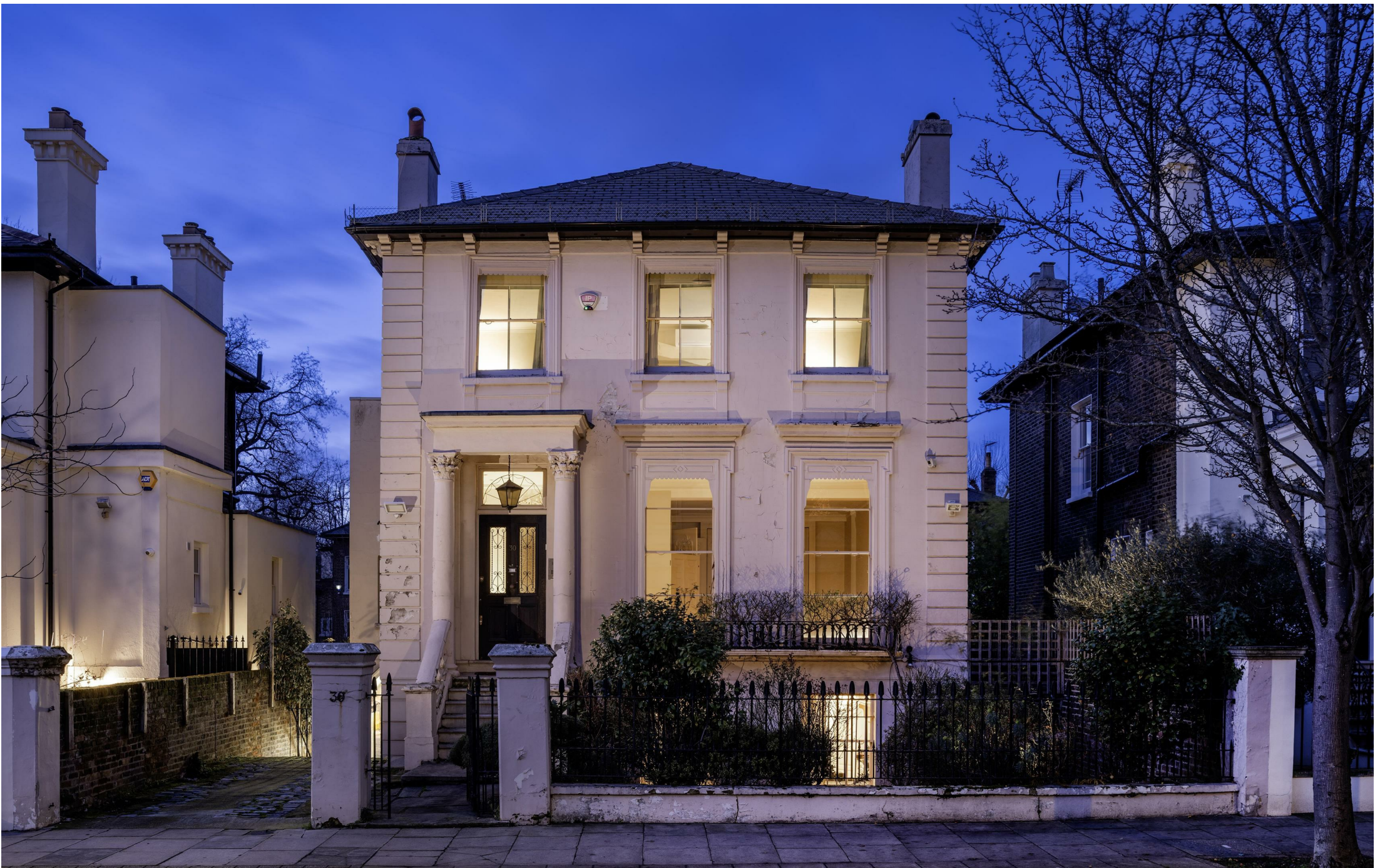
Clifton Hill, London NW8 0QG Asking price £5,995,000 Freehold