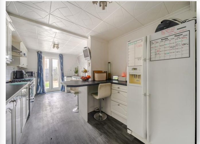
121 Greenfields, Maidenhead SL6 1BD