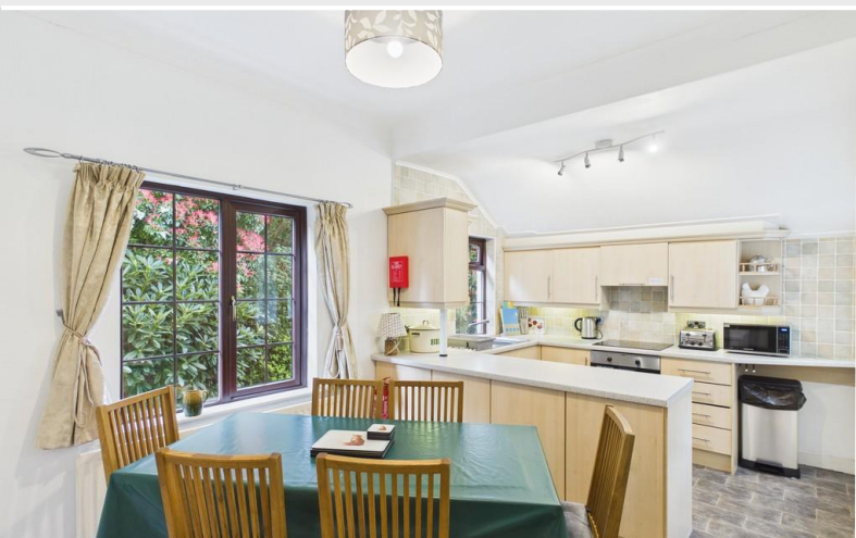
Dining / kitchen

As you approach Elmley Lovett, you'll be greeted by a welcoming façade and a well-maintained exterior. A spacious driveway provides ample parking space, complemented by a convenient garage.