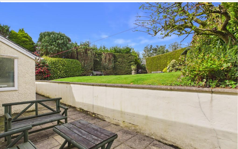
Rear seating area and garden

Dining/kitchen 15' 9" x 9' 9" (4.82m x 2.98m)