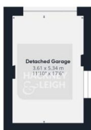
Garage Building 2