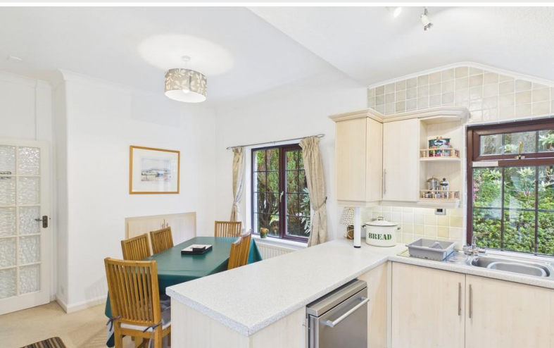
Kitchen / dining room