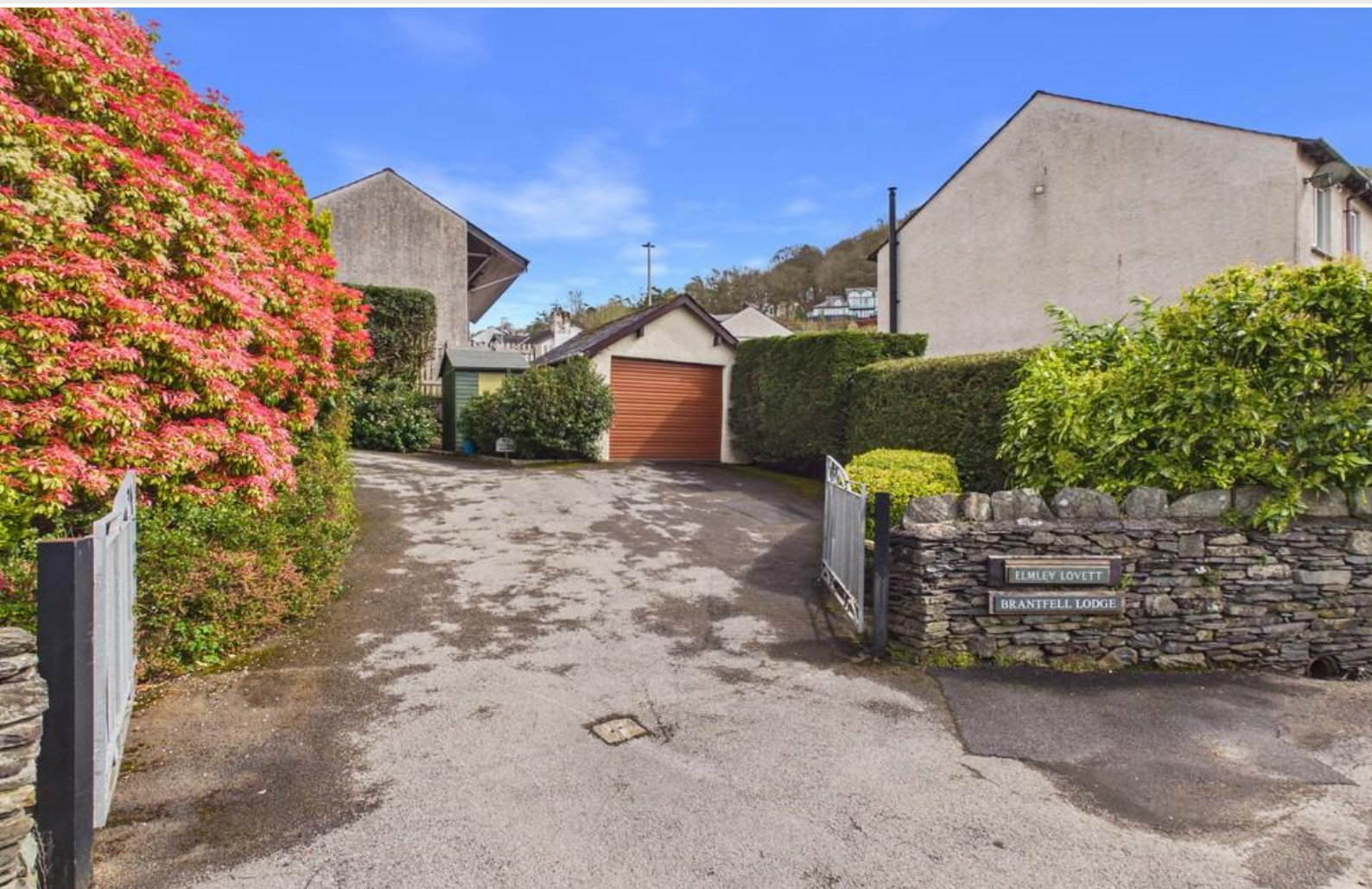
Driveway and garage