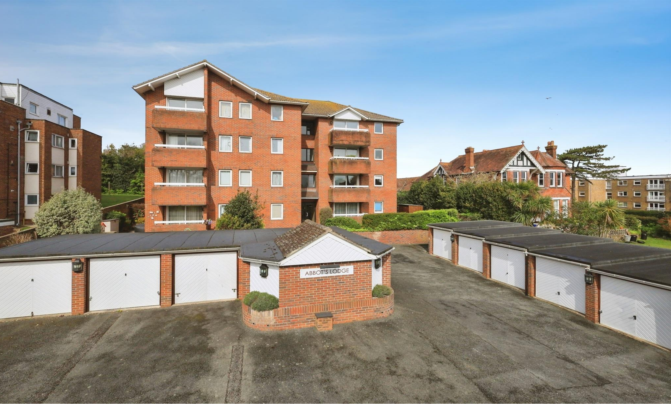
Abbots Lodge Arundel Road, Eastbourne BN21 2EL