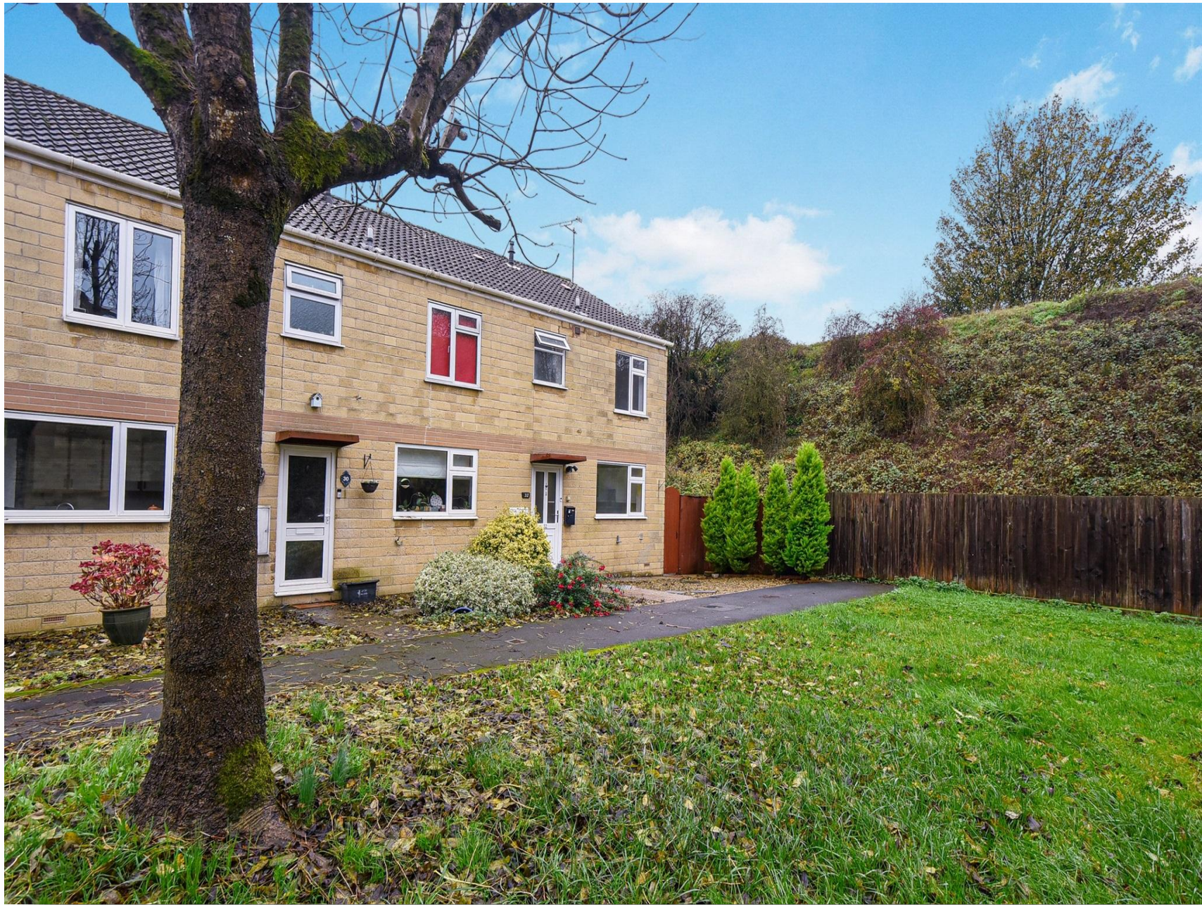
St. Peters Close, Chippenham SN15 2BQ