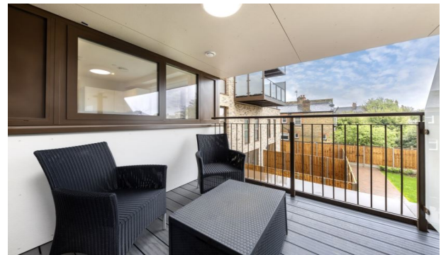
Baytree Road, SW2 Approximate Gross Internal Area 84 sq m / 904 sq ft