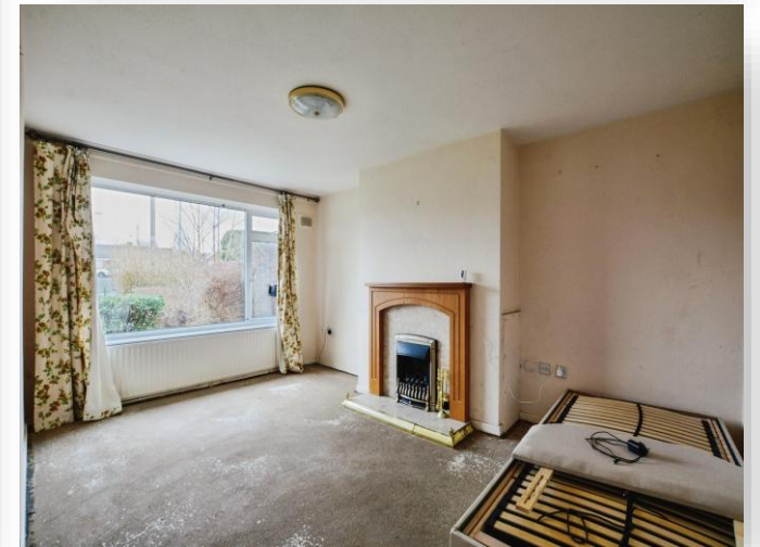
Elm Crescent, Burgh Le Marsh Skegness PE24 5EG