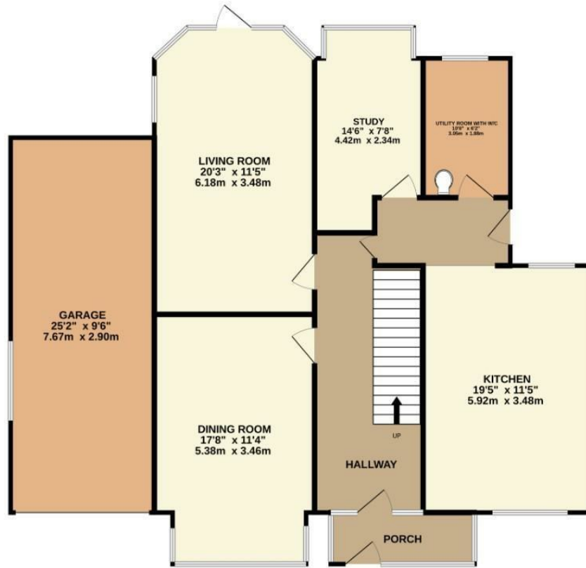
GROUND FLOOR 1285 sq.ft. (119.4 sq.m.) approx.