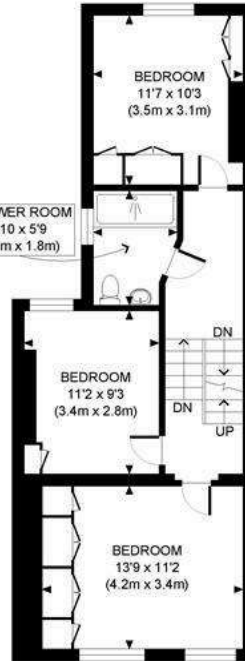
FIRST FLOOR GROSS INTERNAL FLOOR AREA 555 SQ FT