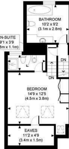
SECOND FLOOR GROSS INTERNAL FLOOR AREA WITH EAVES 432 SQ FT FLOOR AREA WITHOUT EAVES 373 SQ FT

APPROX. GROSS INTERNAL FLOOR AREA WITH EAVES: 1864 SQ FT/ 173 SQM APPROX. GROSS INTERNAL FLOOR AREA WITHOUT EAVES: 1805 SQ FT/ 168 SQM