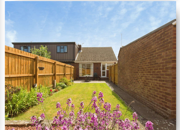
Mill Lane, Histon, Cambridge, CB24 9HW