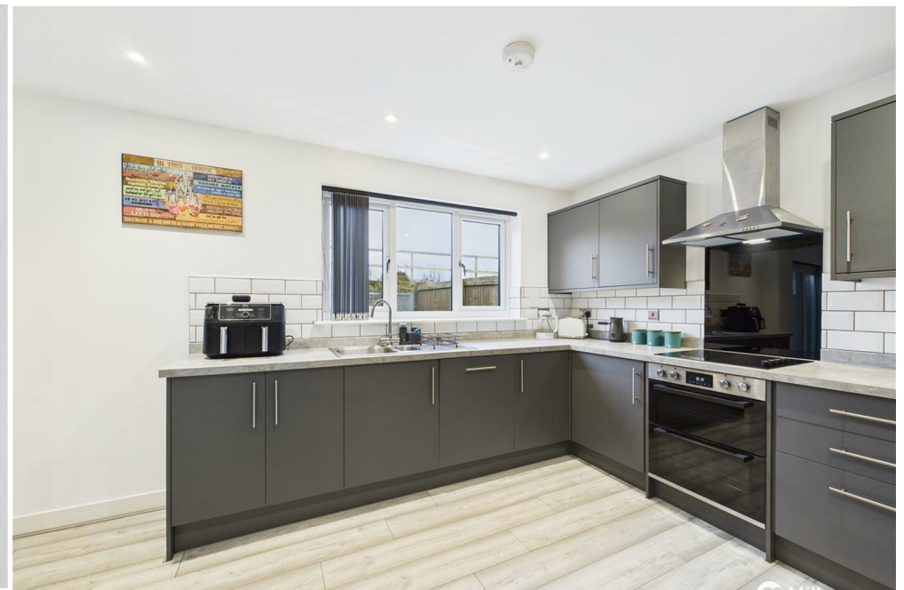
Troon Moor, Troon, Camborne, TR14 9HX