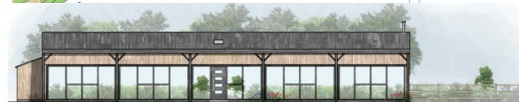
Proposed Elevation A-A