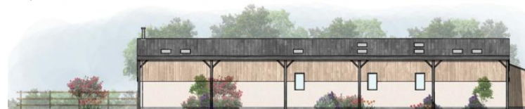
Proposed Elevation C-C