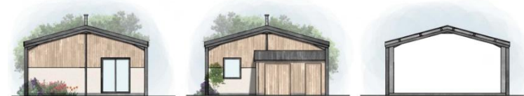
Proposed Elevation B-B