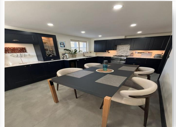
Empress Matilda Gardens, Old Wolverton Milton Keynes MK12 5FZ