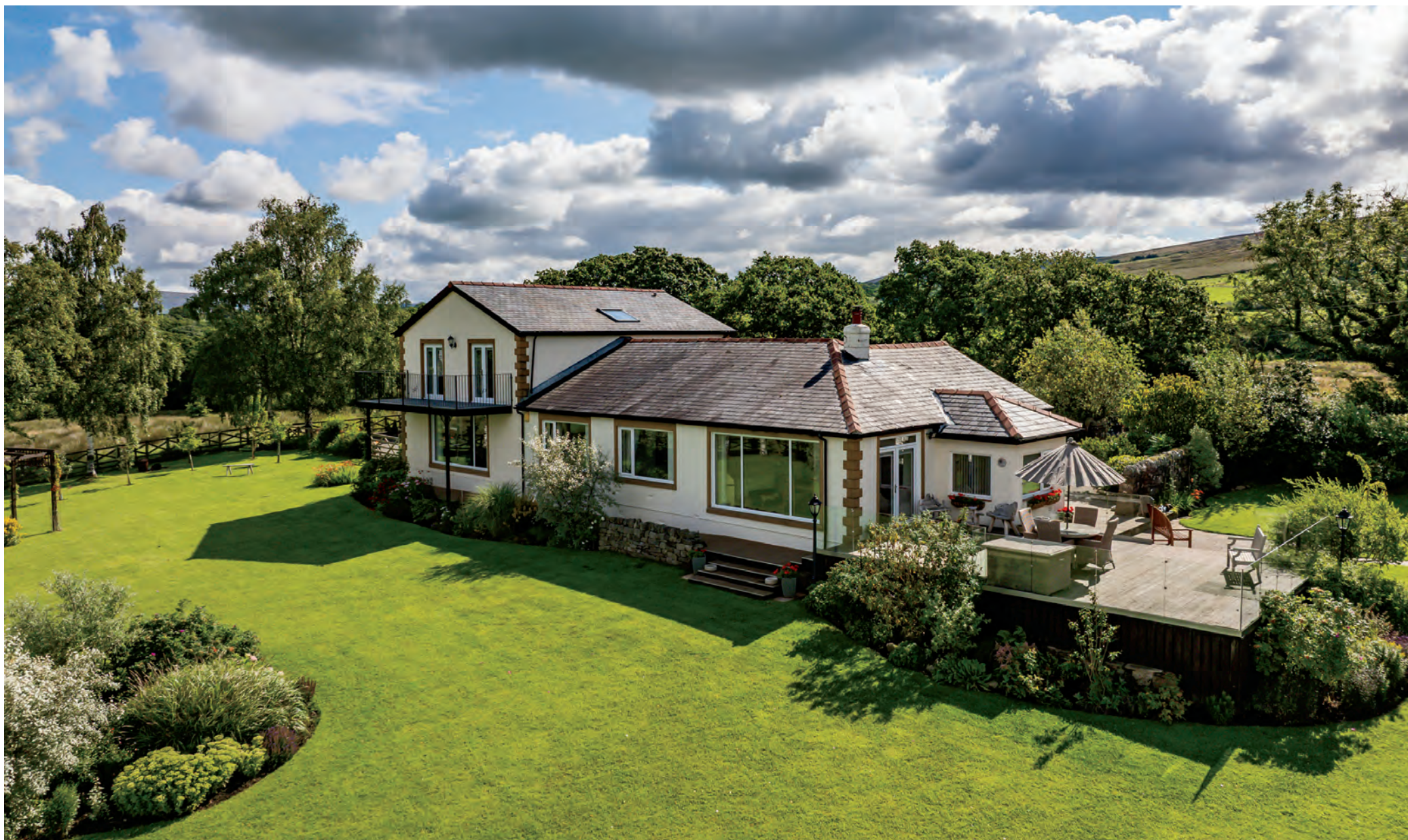
Sandalwood Long Lane | Scorton | Preston | Lancashire | PR3 1DB