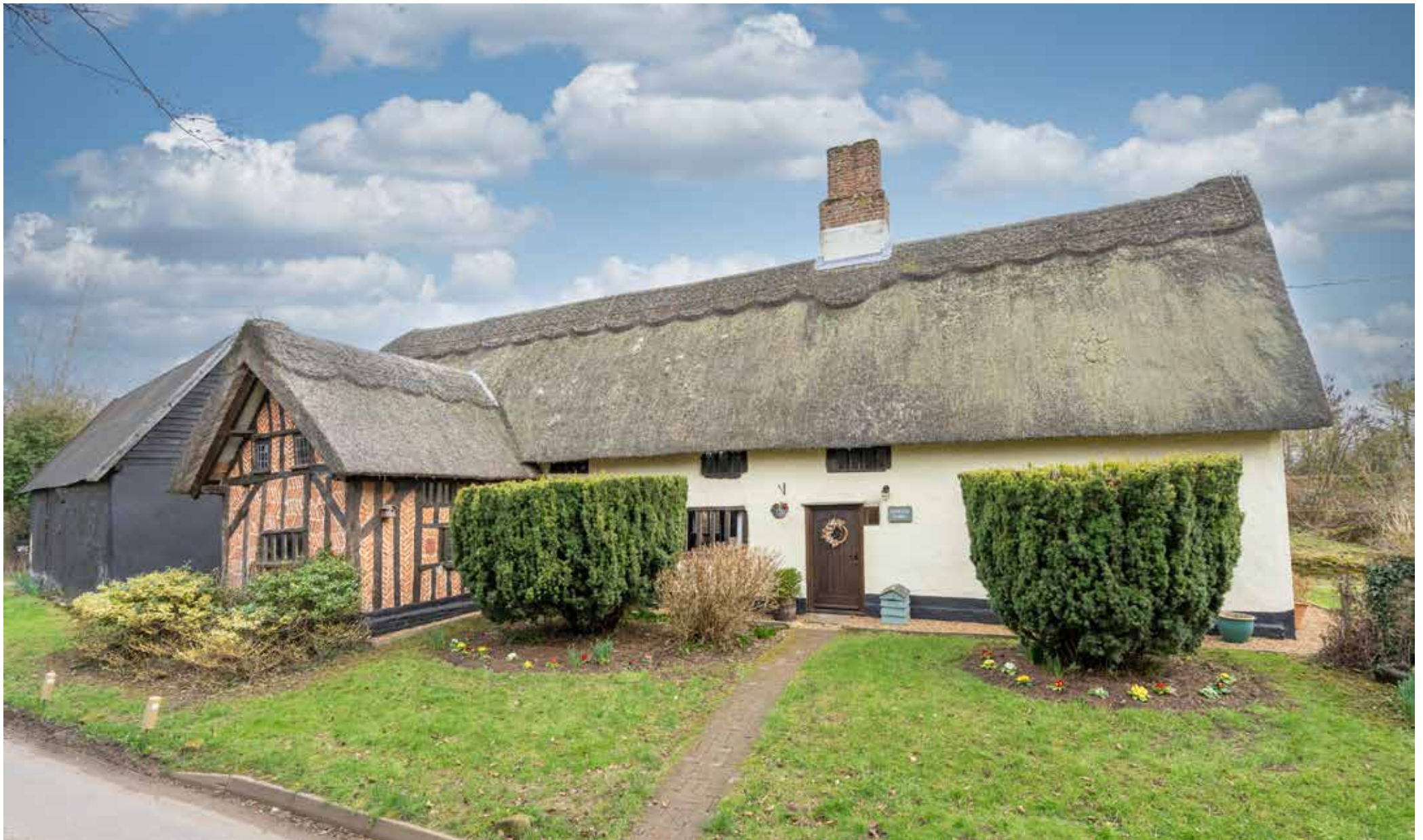
Gowers Farm Low Road | Bunwell | Norfolk | NR16 1SD