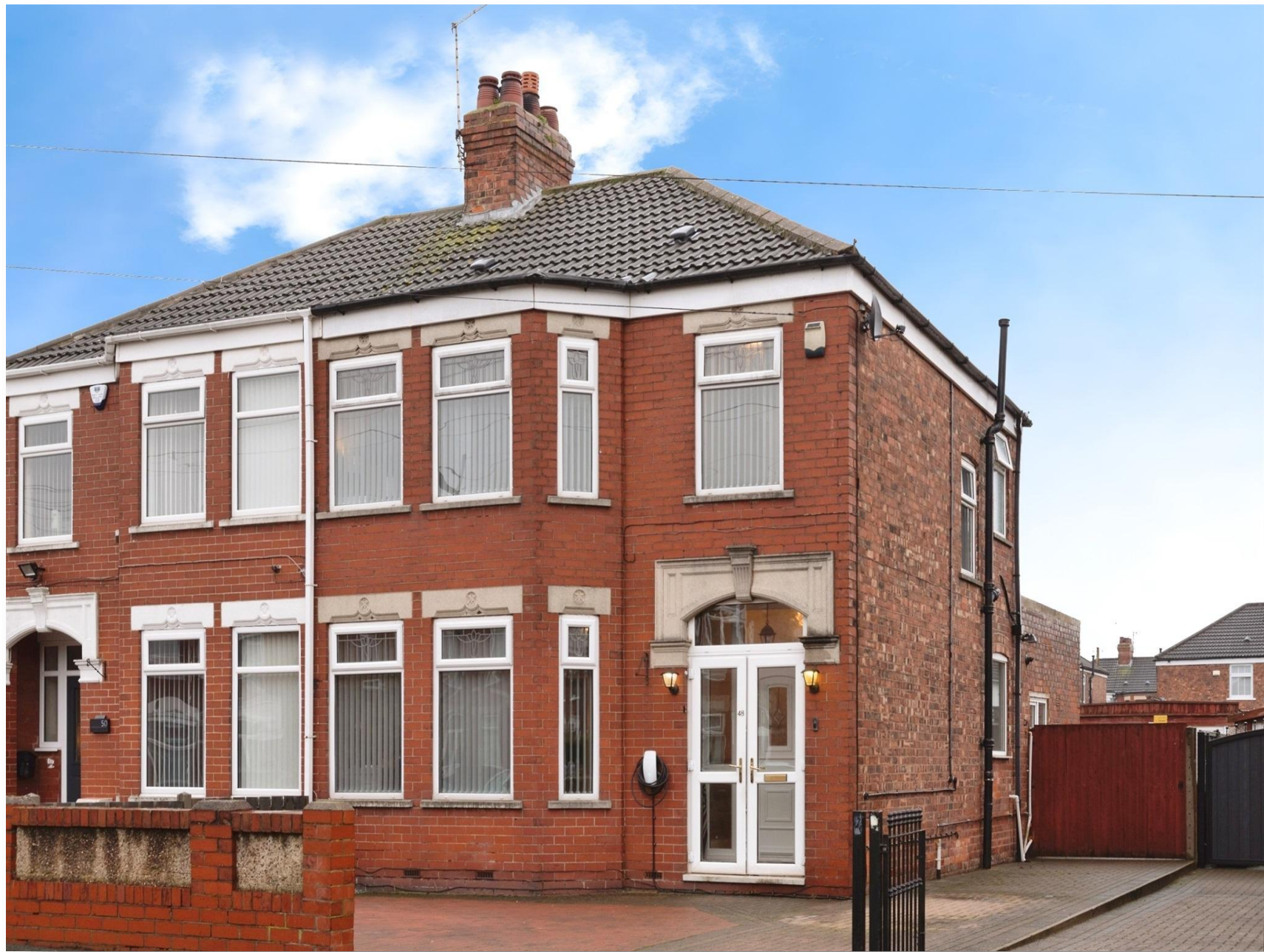
Waldegrave Avenue, Hull, HU8 9BD