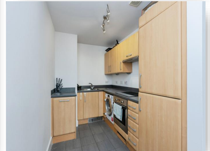
Alexandra House Rutland Street, Leicester LE1 1SQ