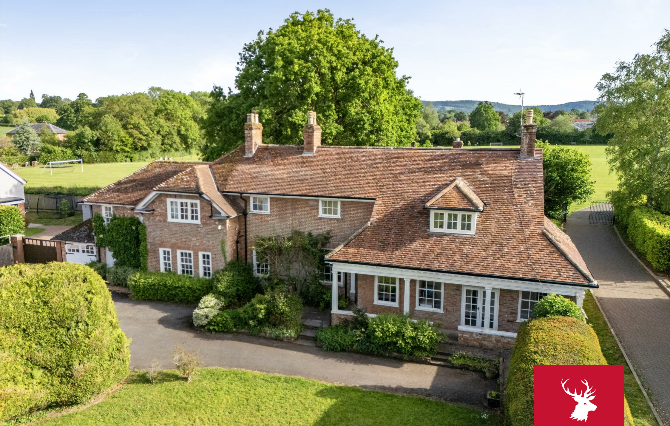
Cherry Orchard House