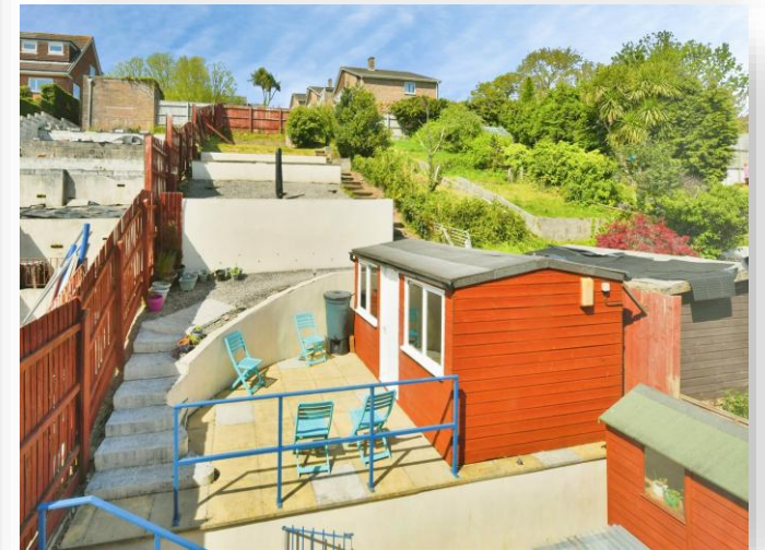
Rashleigh Avenue, Plympton PL7 4DA