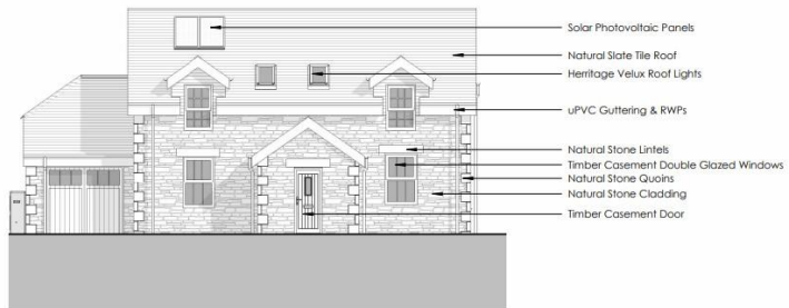
1 South East Elevation 1 : 100