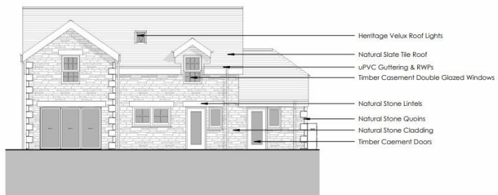
3 North West Elevation 1 : 100