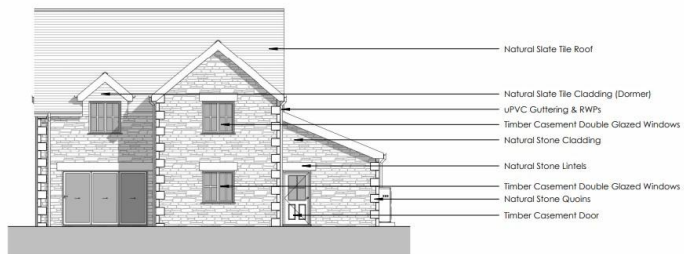
3 North East Elevation 1 : 100