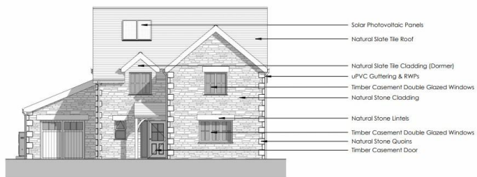
1 South West Elevation 1 : 100