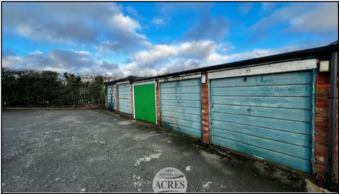
Dunbar Road, Great Barr, B43 7PT