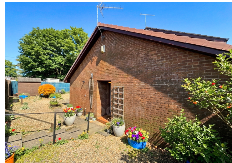
Glebe Court, Beith