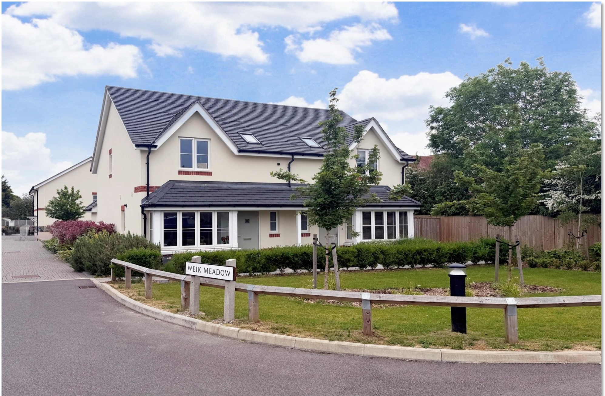
Weik Meadow, Aston Clinton Aylesbury HP22 0AX