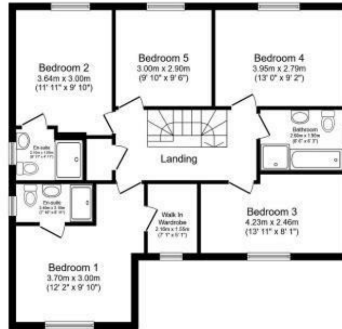
First Floor Floor area 84.7 sq.m. (912 sq.ft.)

Total floor area: 175.8 sq.m. (1,892 sq.ft.)