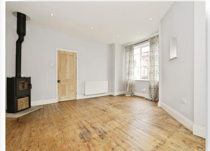
Skipton Street, Harrogate HG1 5JF