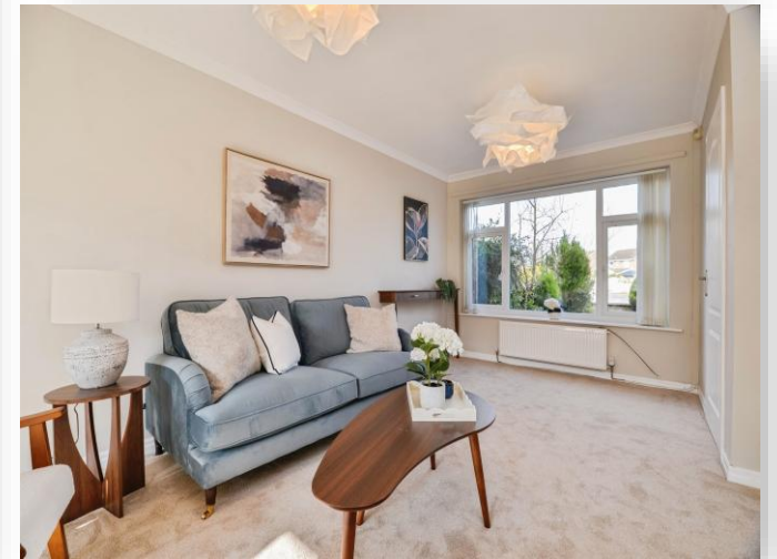
Hayling Way, Stockton-On-Tees TS18 5QF