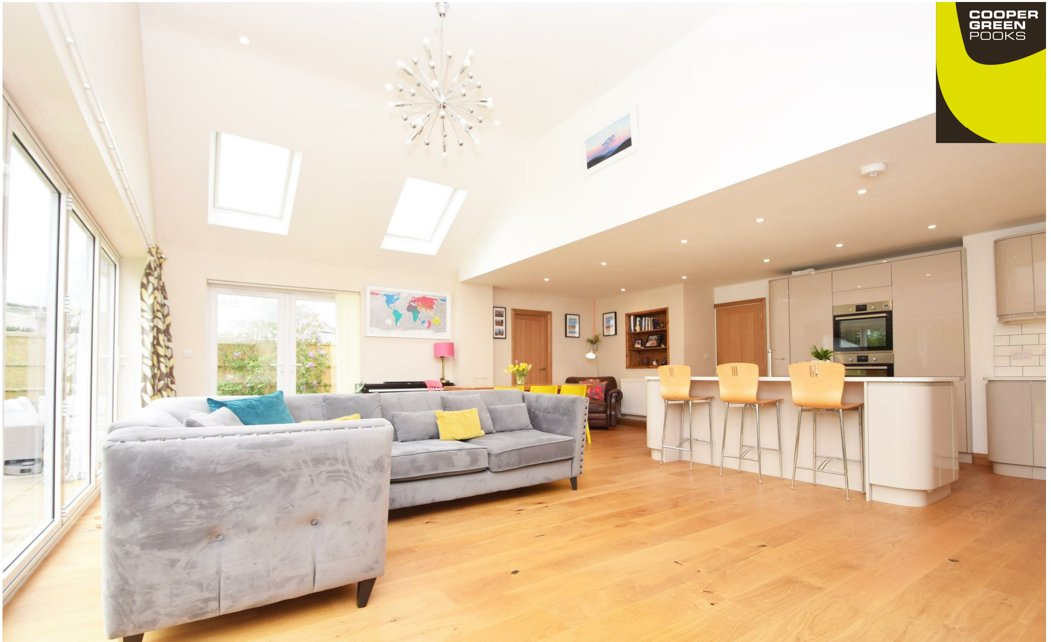
16, Church Close, Bicton, Shrewsbury, SY3 8EN £1,500 Per Month