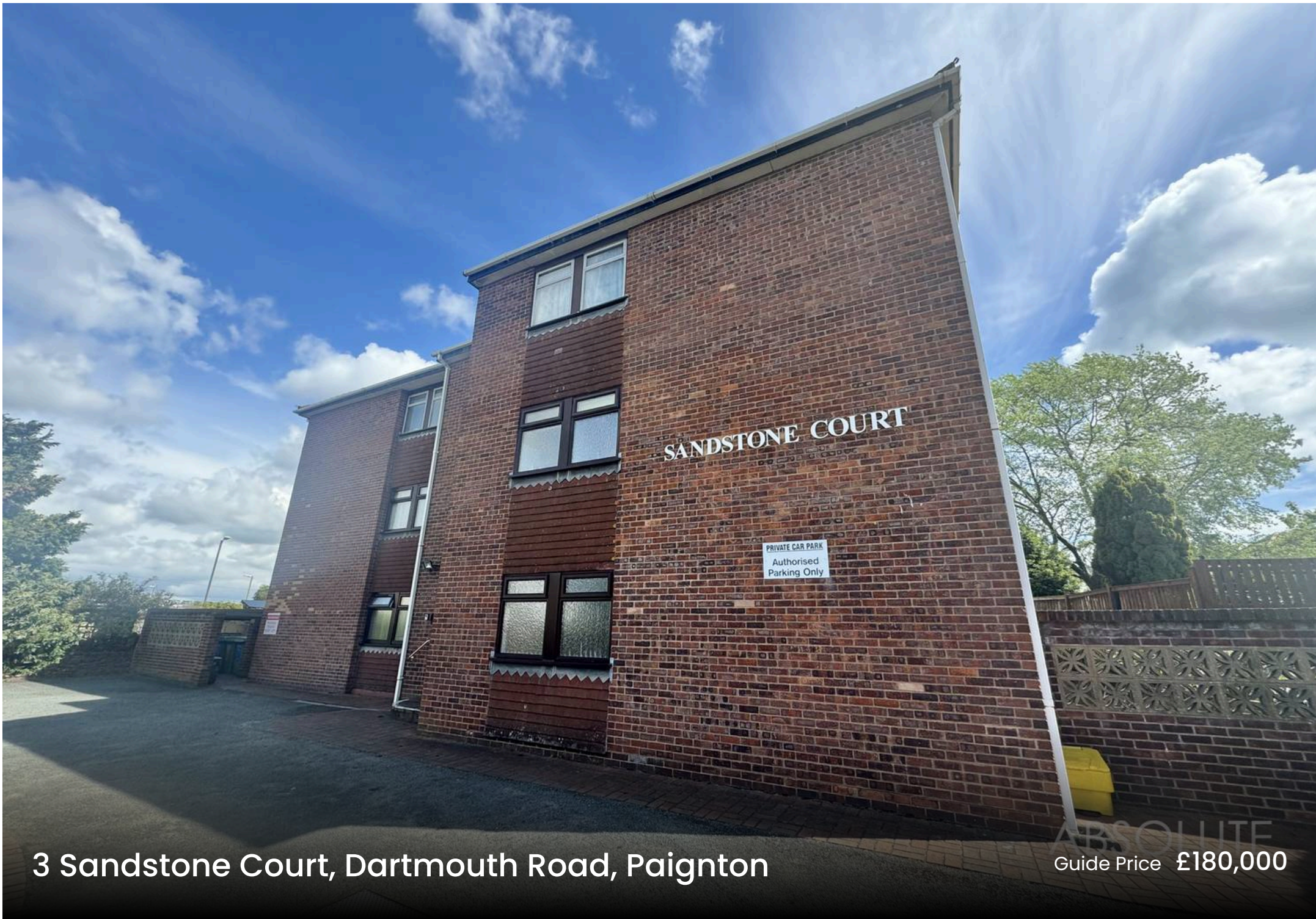
3 Sandstone Court, Dartmouth Road, Paignton