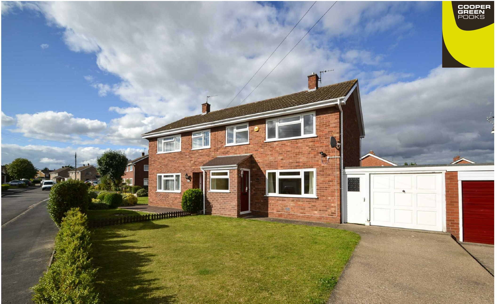
6, Lydham Road, Heath Farm, Shrewsbury, SY1 3HQ £1,100 Per Month