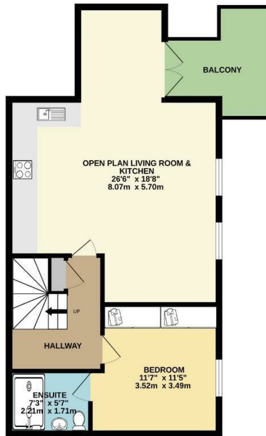
SECOND FLOOR 620 sq.ft. (57.6 sq.m.) approx.