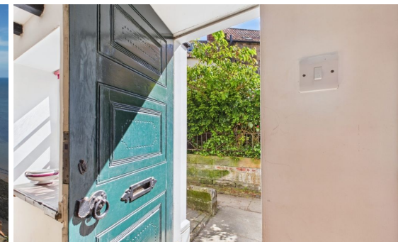
SHERWOOD HOUSE, ROBIN HOODS BAY- 3 bed Character Property -£399,950