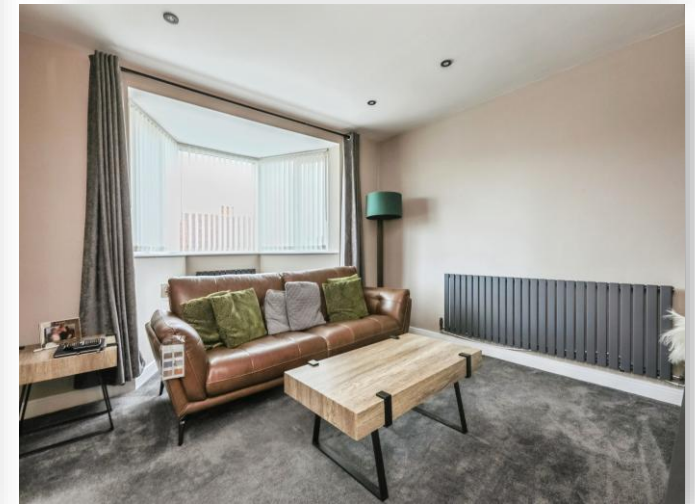
Haywood Close, East Herringthorpe Rotherham S65 3RL