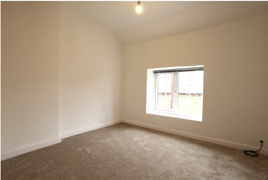
Bedroom Four 8'3" x 8'8" (2.523 x 2.651 ) Window to front.