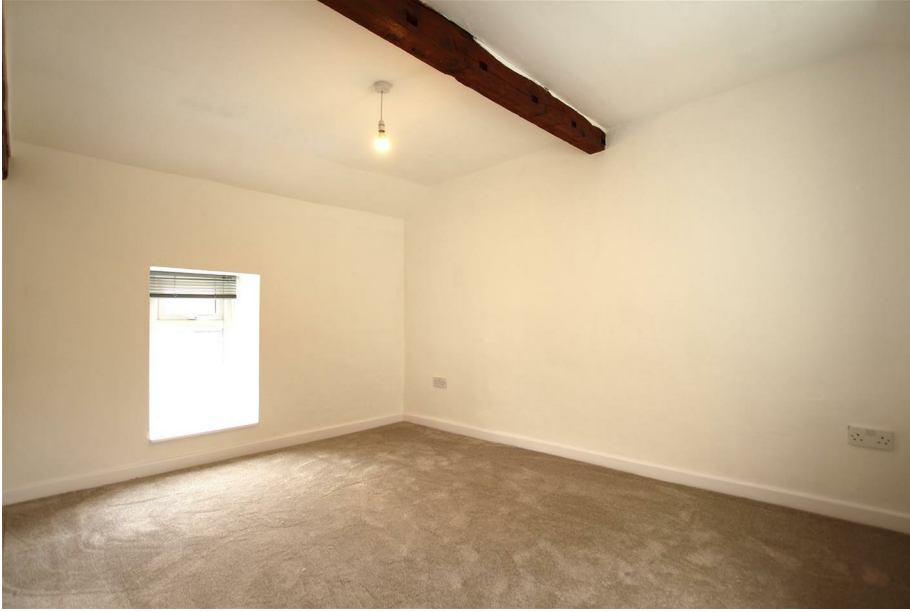
Bedroom Three 8'10" x 11'11" (2.7 x 3.645 ) Window to front.