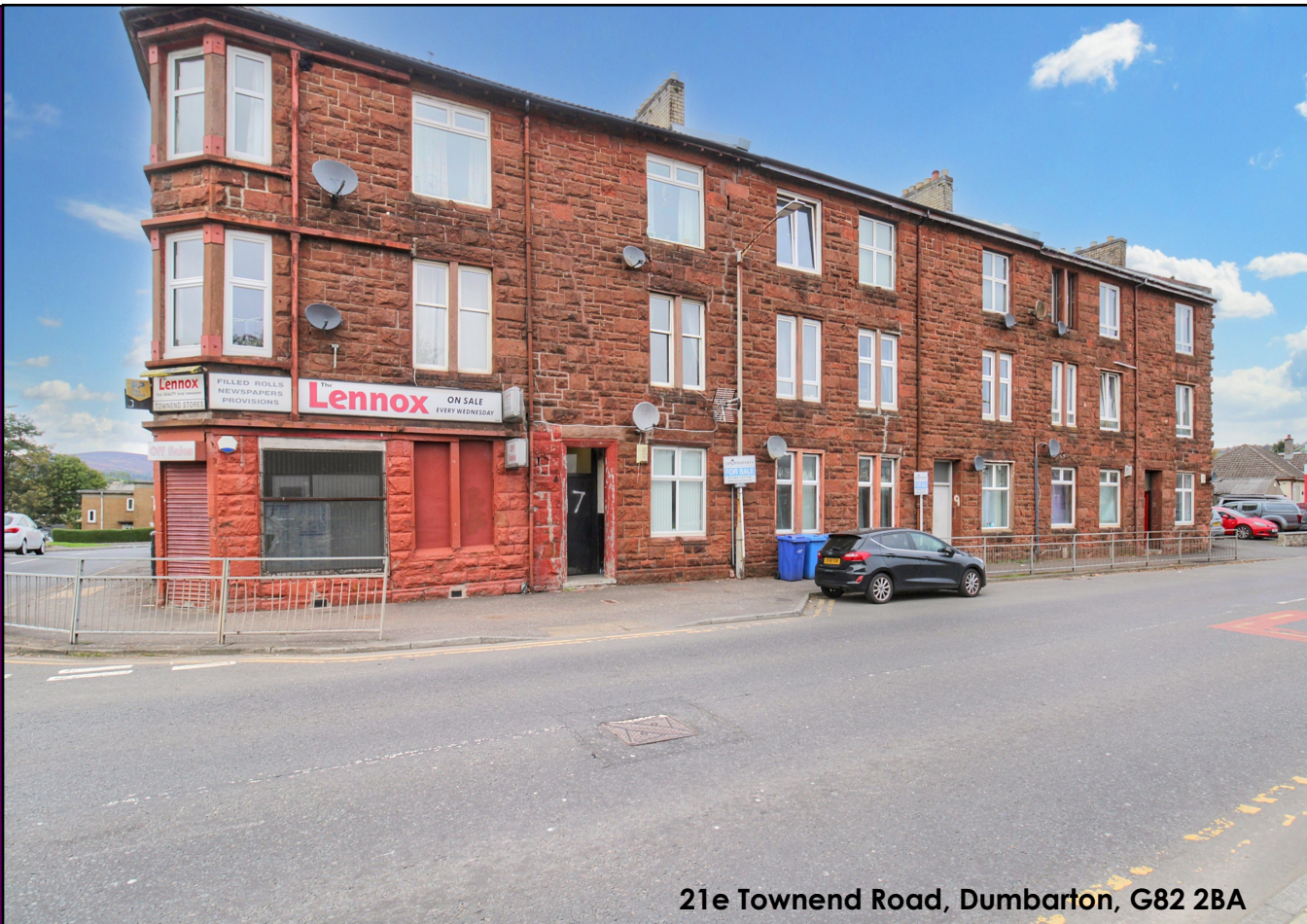
21e Townend Road, Dumbarton, G82 2BA

The agent offers to the market this three-bedroom top and attic floor flat which forms part of a traditional red sandstone block within walking distance to local schools, shops, leisure facilities and public transport links.