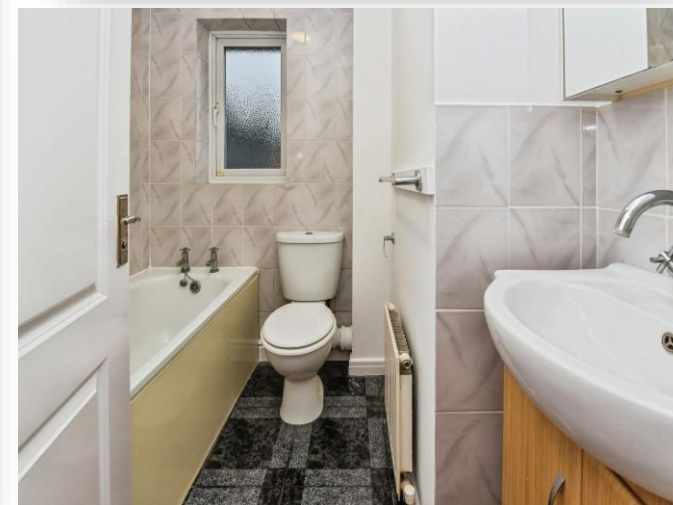
Penny Farthing Row, Westbury BA13 3TP