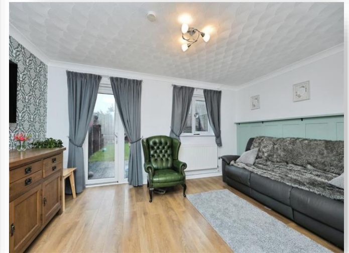
Carl Close, Dereham NR19 1ET