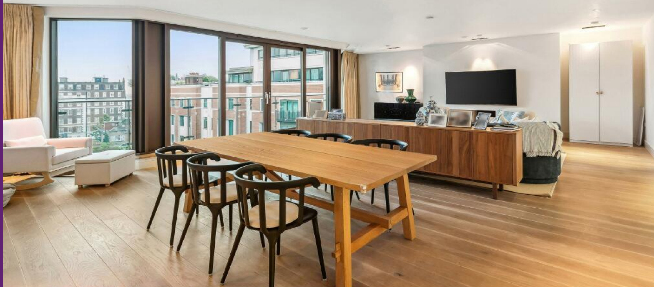
Thornwood Lodge Thornwood Gardens, W8